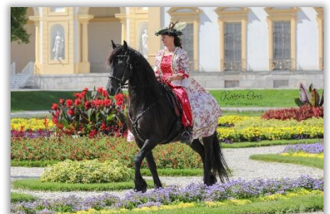
Team „Showpferde Allgäu“